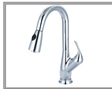
#2LG250 SHOWN * ADA