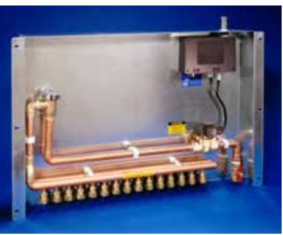
Part Number: PT-2130 Cabinet Dimension: ID 30-1/2" W x 20-1/2" H x 3-3/8"D Access Door Part Number: D-2030PC D-2030SS

The PRIME-TIME PRIMING ASSEMBLY will supply a minimum of 2 oz. of potable water at 20 PSIG at a preset factory setting of 6 seconds every 24 hours. The entire unit is pre-assembled in a steel cabinet ready to be flush wall mounted.