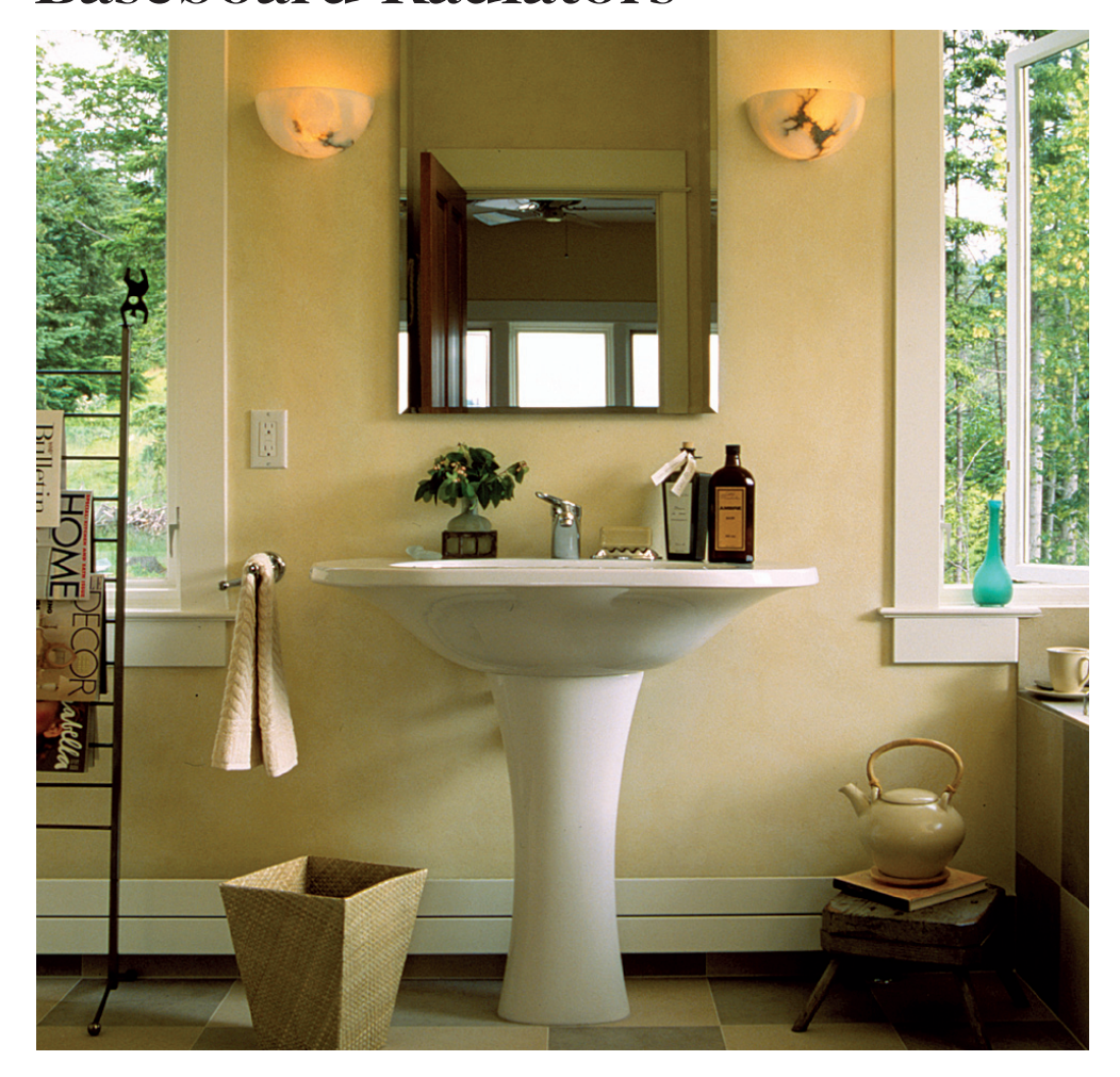
Runtal's Baseboard style is ideal for those desiring a low profile. As a retrofit, Runtal baseboard is a natural replacement for fin-tube or cast iron. In these cases, it is often easiest to use the existing piping and simply order the appropriate lengths. Depending upon the heat output, or the desired design "look", Runtal will supply baseboard styles ranging from 1 to 4 tubes high.