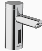
Variation not shown: Integrated Side Mixer