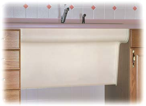
Available in white or beige (as shown above).

The BASIN GUARD complies with ADA article 4.19.4, California Plumbing Code 1504.2.1, ANSI A117.1, BOCA P 1203.4, and other state and local regulations. BASIN GUARD also has a flammability resistance, tested in accordance with Underwriters Laboratories for the UL 94 standard with a V-0 rating.