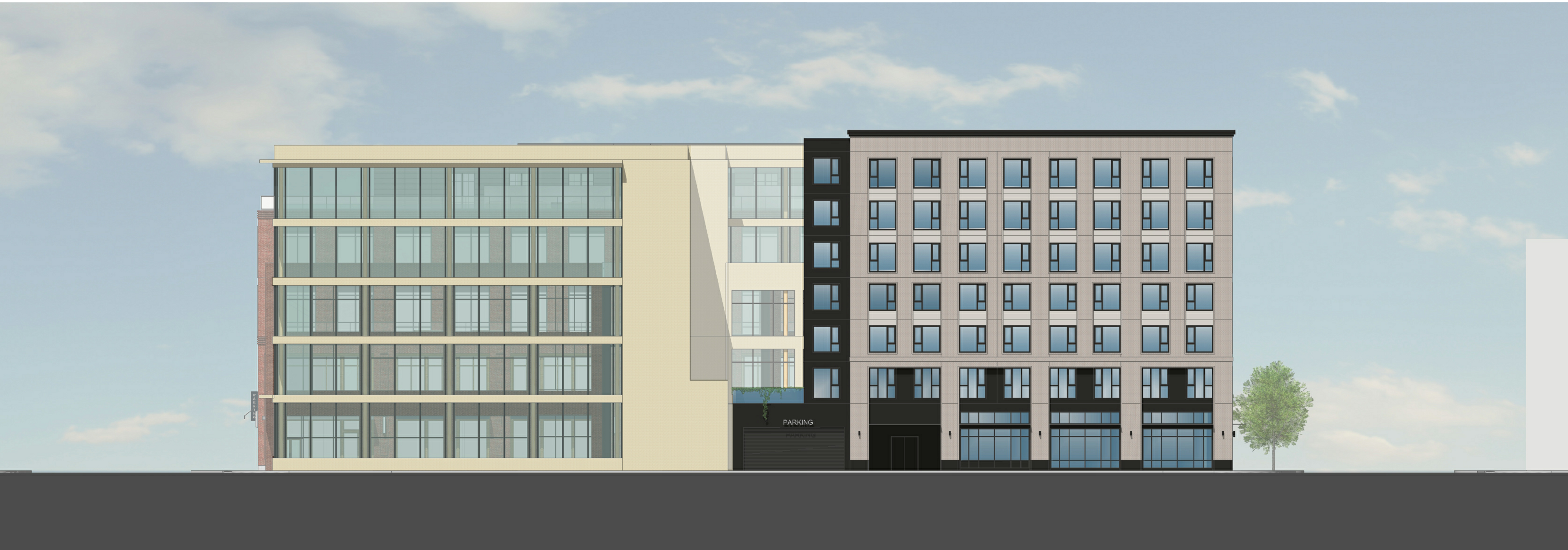
BLOCK ELEVATION - RAILROAD AVENUE 2