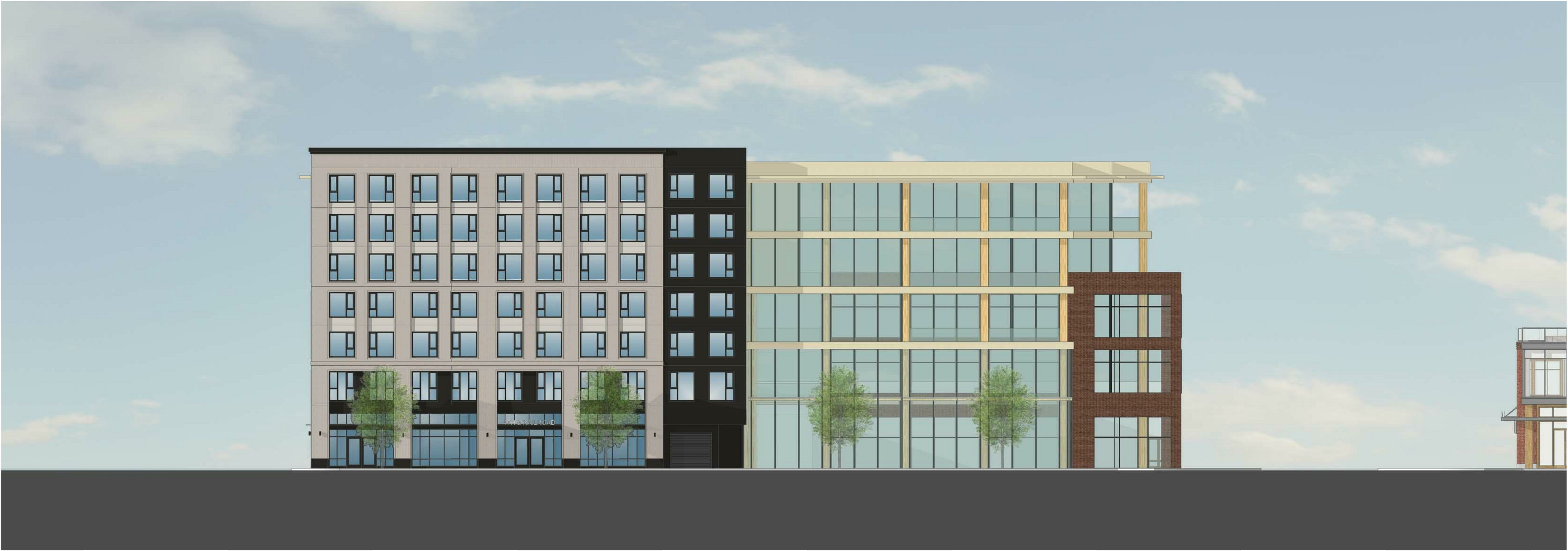
BLOCK ELEVATION - E 4TH AVENUE 1