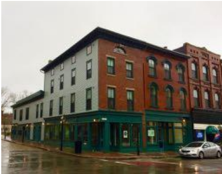
People's Pressed (an E for All alum) is open for business at 141 Union St.

WHALE officially opened the doors on March 15. The project is fully tenanted and programming will start at 139 Union Street soon!