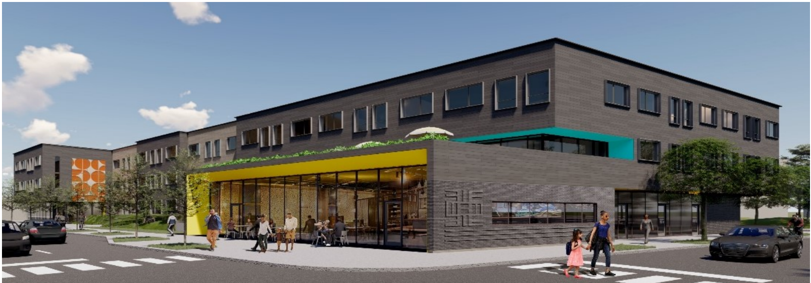
Community design concept: Looking at south building across Fifth Avenue