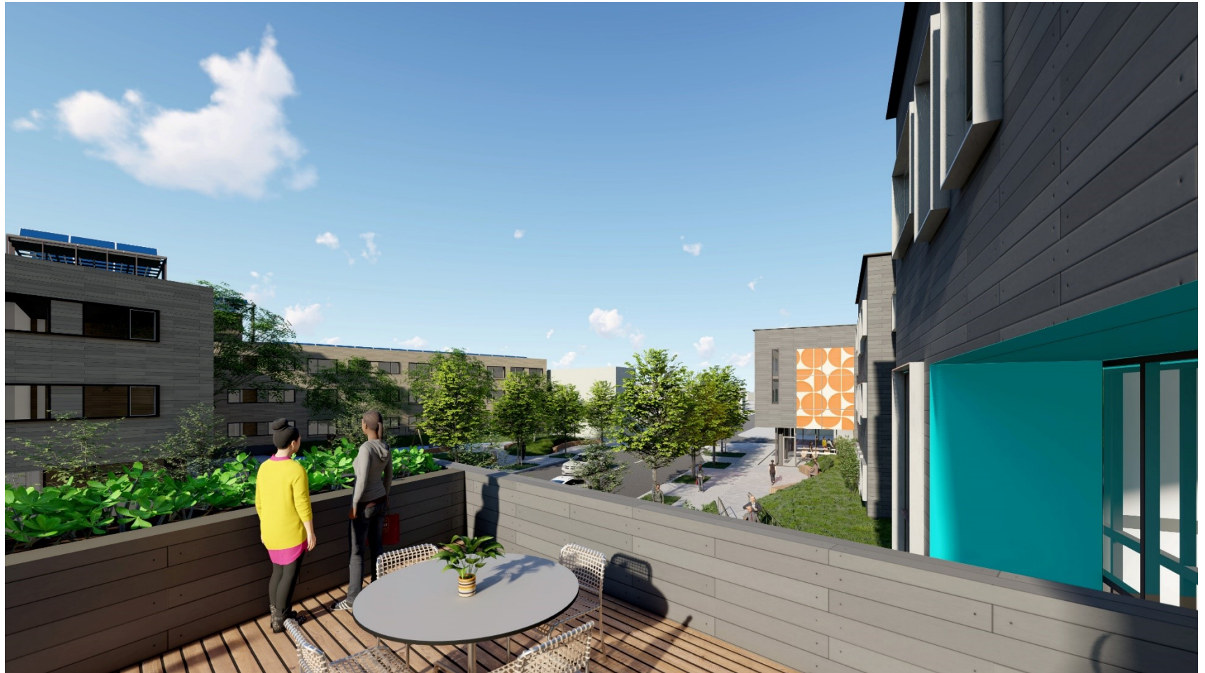
Looking east from resident terrace