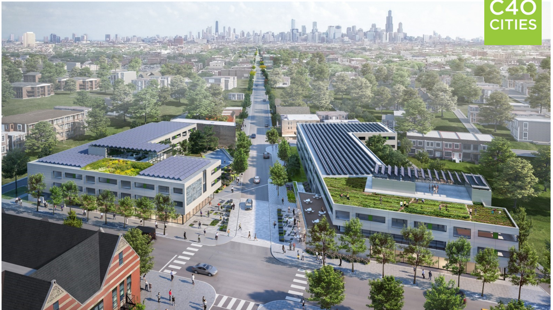
2018 Design concept: Looking east down Fifth Avenue