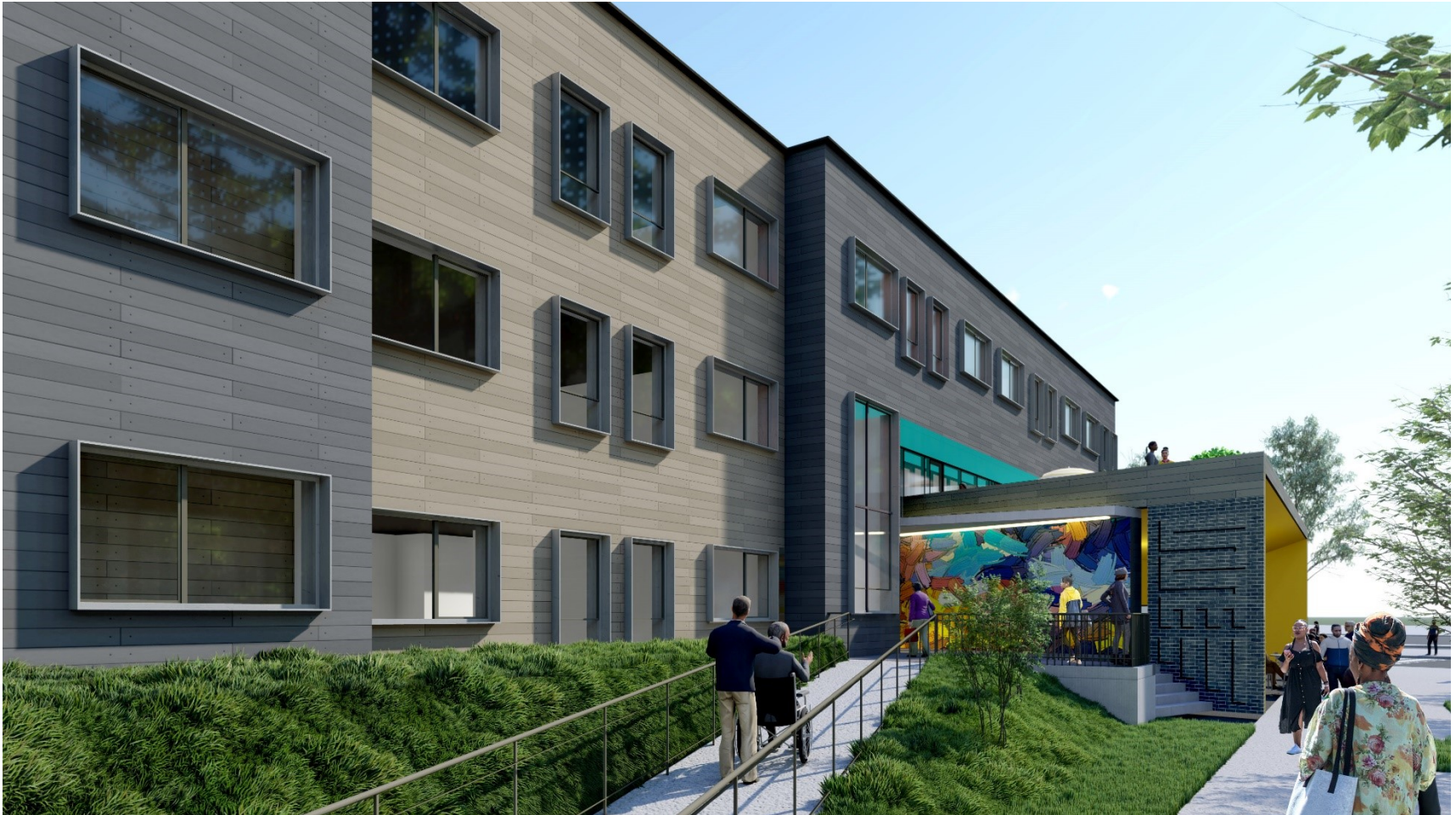
Looking west toward entrance