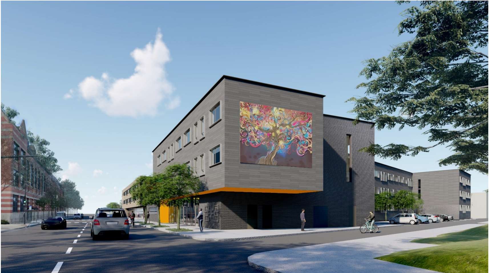
Looking North on Kedzie