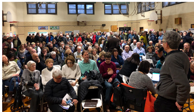
Participants listen during the Project Team's Presentation, which was followed by an open Q&A session.

1 - Based on self-reported data collected from Public Feedback Forms provided at the events. 2 - Generated from 2017 ACS 1-year data.