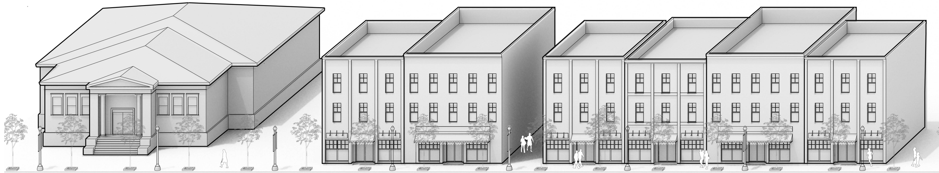
Examples of Encouraged Streetscape Facade Typologies