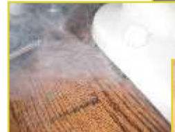
EZsmoke's non-toxic smoke formula makes leaks easy to find.

EZSMOKE is GREAT for leak testing in schools, restaurants, or shopping malls during business hours.