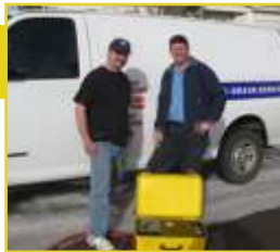
Contractors and customers like the speed of finding & fixing leaks with EZSMOKE.

Contractors who tested EZSMOKE on real world projects unanimously approve of its non-toxic smoke technology. With EZSMOKE they found their problem sections of pipe faster than ever before, every time.