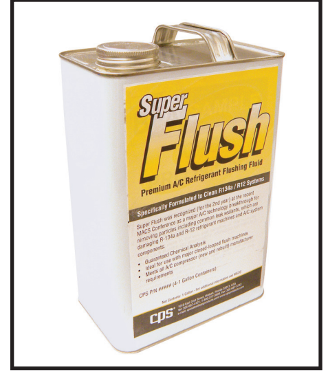
Store in a cool, well ventilated area

DISPOSAL: INSURE THAT USED PRODUCT AND CONTAINERS ARE PROPERLY DISPOSED OF IN ACCORDANCE WITH ALL LOCAL, STATE AND FEDERAL REGULATIONS.