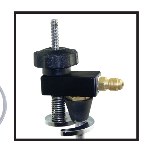
#12 Universal couplers