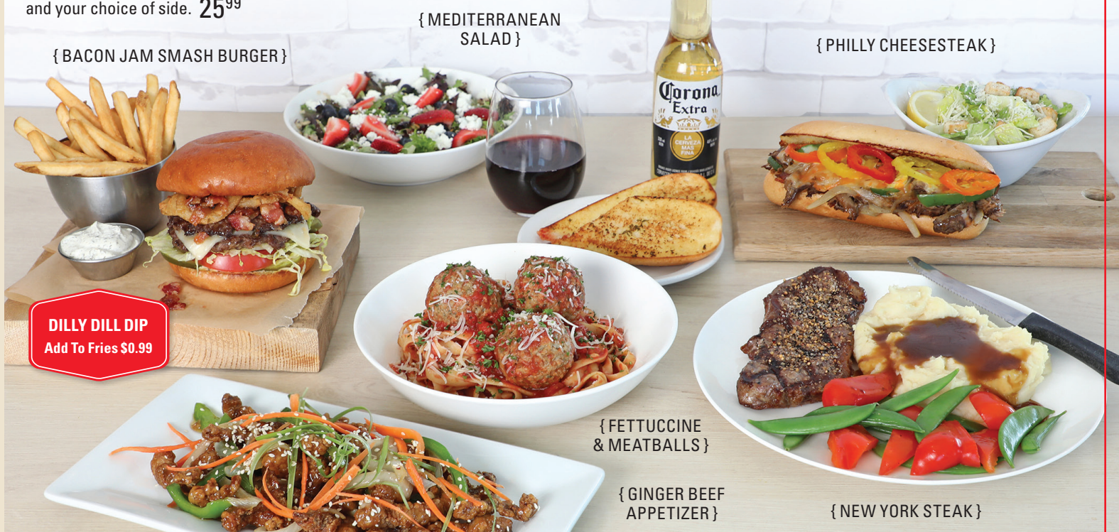
{ BACON JAM SMASH BURGER }

A grilled tortilla filled with chicken, shredded cheese, and pico de gallo. Served with salsa and sour cream. 19 99