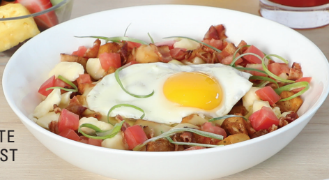
{ BIG COUNTRY BREAKFAST }