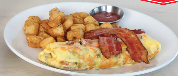
{ BACON DENVER OMELETTE }

UPGRADE YOUR HASH BROWNS TO LOADED HASH OR BREAKFAST POUTINE FOR ONLY $2.99