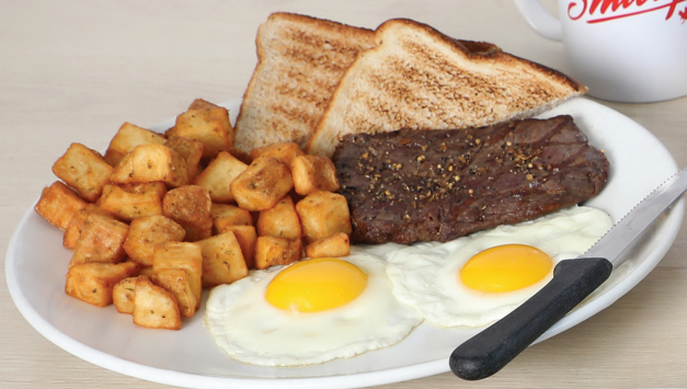
{ STEAK & EGGS }