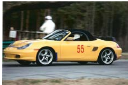
2003 Boxster