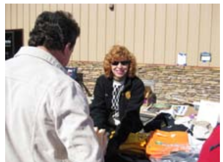
February 21st Swap Meet