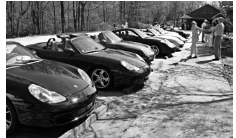
Photos from the Spring Drive

The regional holiday party will be held in Greenville this year at the Hyatt Regency downtown on December 5. Please mark your calendars now, and we'll share more details as we get closer to the date.