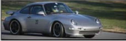
Porsche Parade 2009: Tradition, Friends, Fun, Surprises and the Passing of an Era

Porsche Parade 2009 marked the fifth Porsche Parade that I have attended since joining PCA in 1995. Surprisingly it took 10 years before my first Parade in 2005. It just so happens that this was also the 50th Parade and since it was being held on the East Coast we all knew that it would be oversubscribed, and it was. I was somehow lucky enough to get in as an 'official' registrant. Many other local members were not so lucky but most decided to travel to the event anyway.