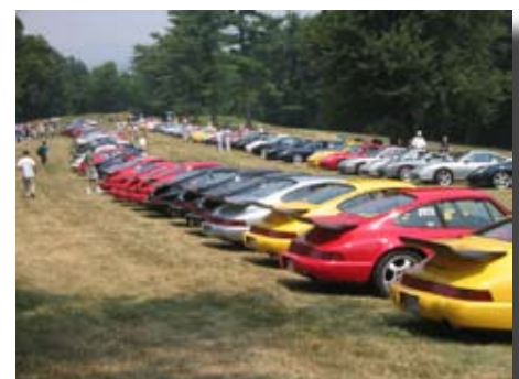
964 RS Americas on display at Parade Hershey