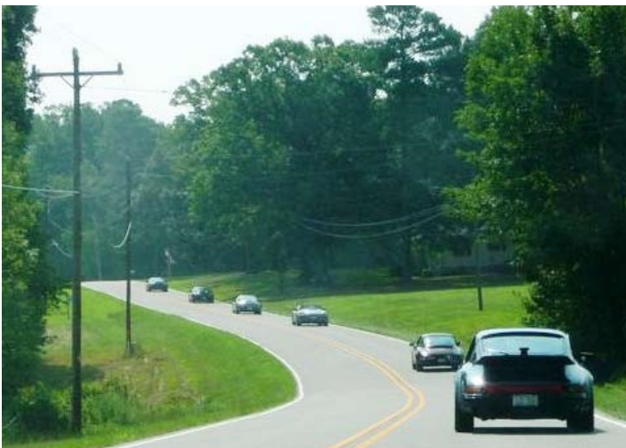
Above: Back roads on the BBQ Run to Wake Forest Right: Enjoying dinner and admiring cars at the August 19th Triangle Area Monthly Dinner/Meeting