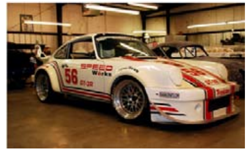
Left and Center: The group of enthusiasts meeting for coffee before leaving for the Speedwerks Open House and Swap Meet in Thomasville, NC (Triad Area) Right: Examples of Speedwerks' work