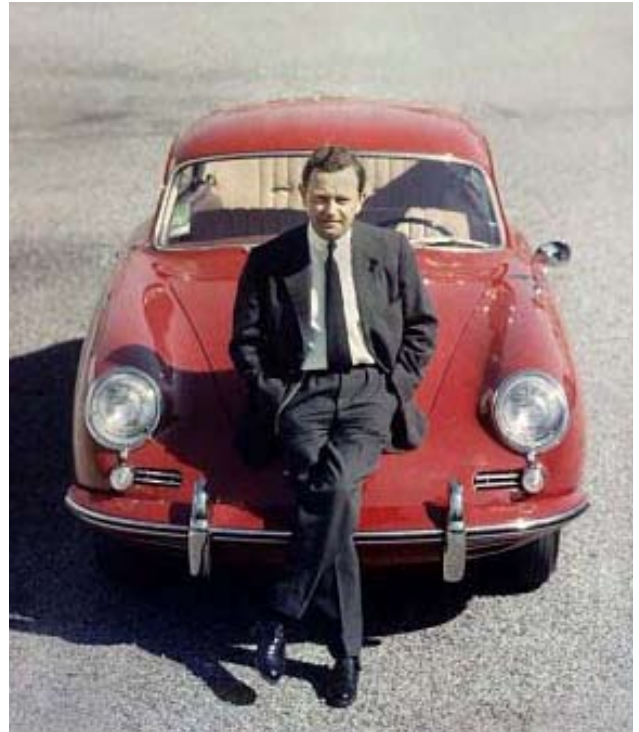
Right: The Birthday Boy himself.

Yours in the pursuit of Porsche excellence =>