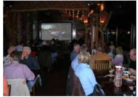
Photos from Triad's monthly February meeting.

May 21, 2011 (Saturday) – Porsche Corral - The Triad Area PCA will join up with the American Children's Home located in Lexington, NC for their annual Car, Truck and Motorcycle Show. (Details later)