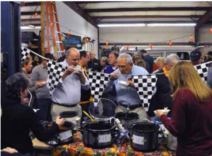
Judges (top left), winners (top right) and the masses (bottom) at the Protech Chili Cook Off.