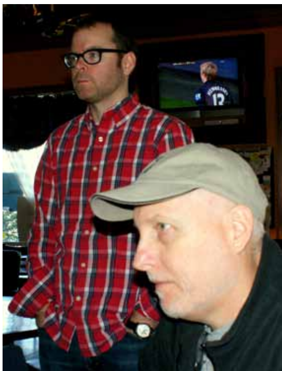
Left: See and be seen at the Triangle Area's monthly meeting.