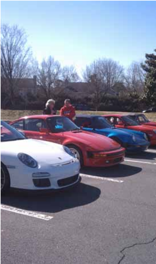
Above and lower left: shots from the February Salsarita's Show and Shine.