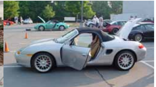
1999 Boxster and 2000 Boxster S

Again hosted by Albie Blanco at Hendrick Porsche, we set off on a muggy Saturday afternoon in a Boxster S with PDK on the regular test loop up Margaret Wallace Road, swapping seats about a mile after leaving the dealership. While the new Boxster does not have the thrust of the new 991, I was immediately impressed by its pace and the ride. Taught, but smooth and compliant. The turn-in is on par with the 991, but the previous differential in the balance between the 911 and the Boxster has been negated by the increased wheelbase of the 991 and the movement of the axles further to the rear. The Boxster didn't lose anything but the 991 definitely gained.