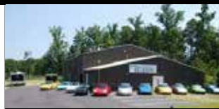
All Cars are kept secured indoors.

Come see our brand new secured 10,000 square foot facility with dedicated engine room.