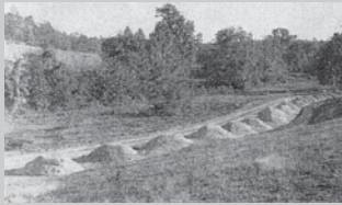
#2 - Bridge Area