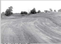
#1 - Uphill Esses

Below is a key to last month's history story showing track construction of VIR.