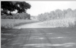
#4 - Uphill Esses?