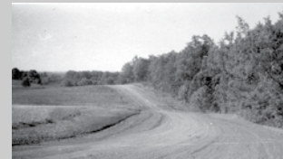
#6 - Entry to Oak Tree (looking counter- race)