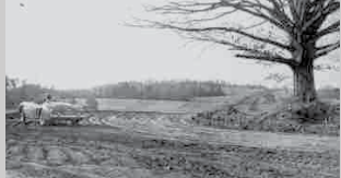
#3 - Oak Tree