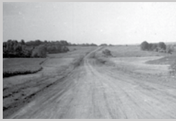
#5 - Back Straight