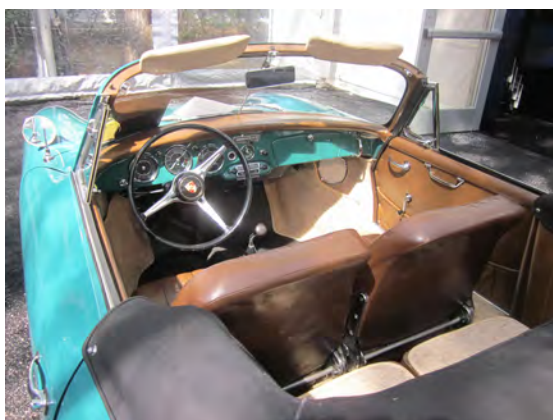
Smyrna Green 356 Cabriolet