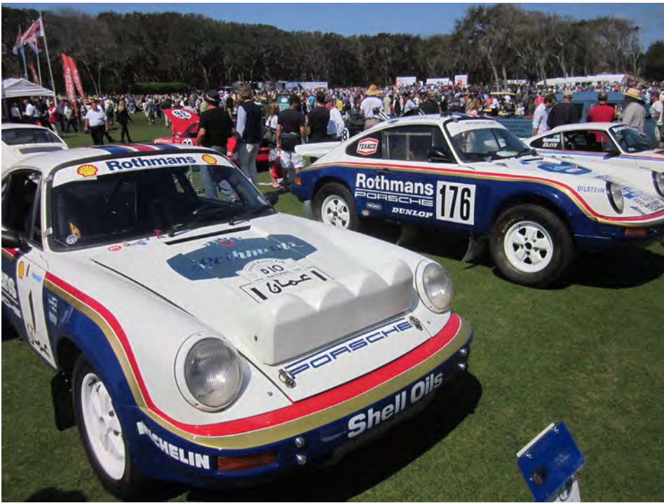
1984 Factory Rally Cars, as they were when last raced

than a production 911, in that the doors and side glass will not fit a production 911-truly one of a kind!