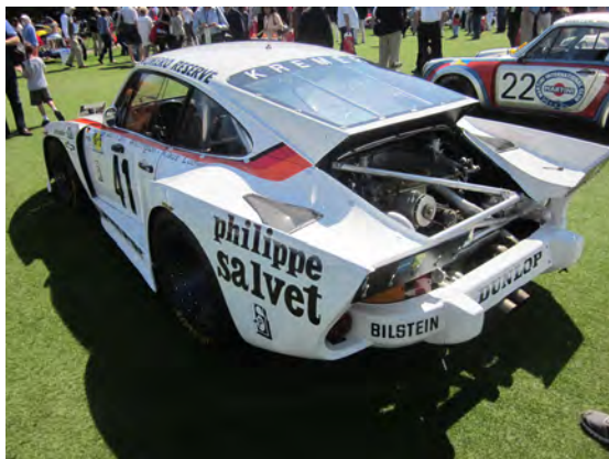
1979 935 K-3

dining and some great blues music and the oldest bar in Florida; the Palace Saloon, which has been open since 1903!