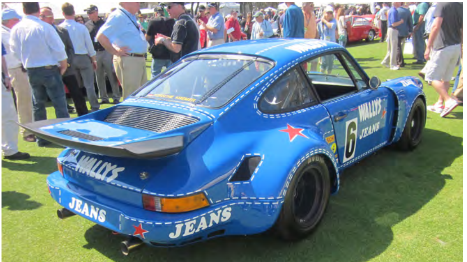
1974 911 RSR 3.0 Liter