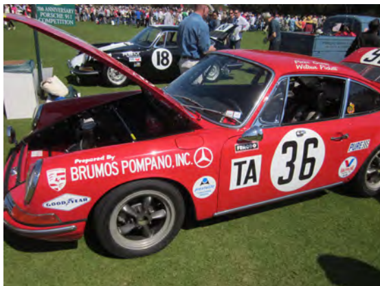
1965 911- winner 1968 SCCA B Sedan Class