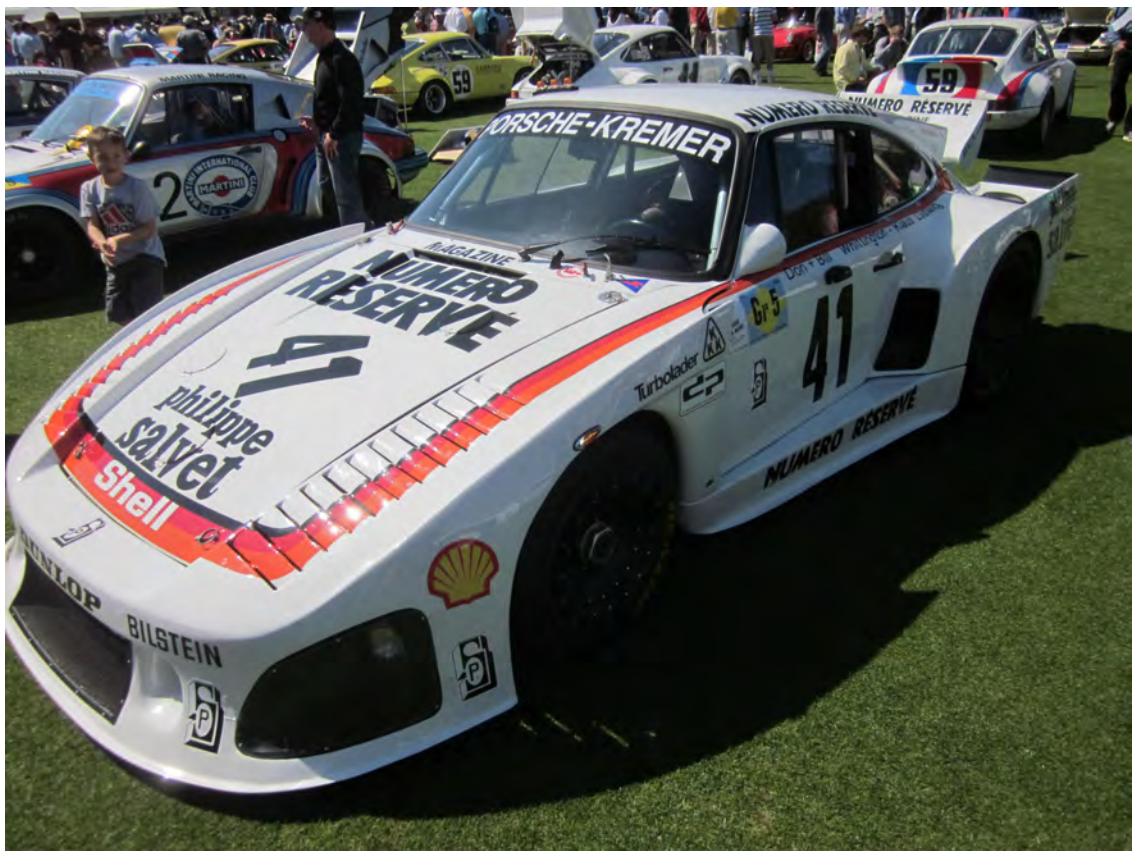
1979 935 K-3, winner 1979 LeMans, and some say, the most important 911 of all