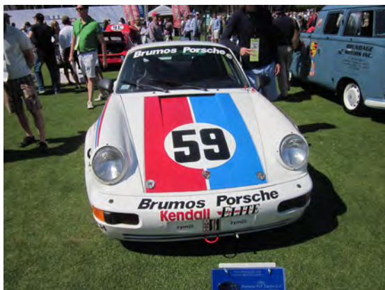
1991 911 Turbo S-2

Saturday, excellent weather greeted us once again, and we headed over to the Ritz Carlton to view the RM auction. Among some of the sales prices on Porsche's - 1959 356A convertible D by Druaz- sold 170,500. 1959 356A Speedster by Druaz- 159,500. 1963 1600 Super 90 Cabriolet -by Ruetter, 143,000. 2000 911GT3 R -sold 121,000. 2005 Carrera GT -sold 357,500, And a beautifully restored 1970 908/3 -which sold for $1.3 million. The highest bid of the day was a 1935 Duesenurg model SJ Convertible selling for $4.,5 million. Something new this year was the the Amelia Festival of Speed, held at the Omni Plantation Country Club. This first year featured Lamborghini, and 100 years of Aston Martin.We headed down there after the RM auction,it was very nice with a good turn out, featuring a wide variety of cars, something that will only get better and larger each year. Saturday night we decided to go to downtown Fernandina Beach for fine