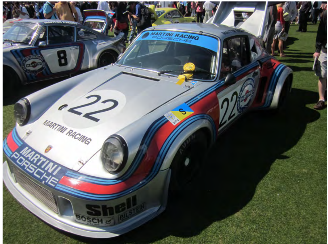
1974 911 RSR 2.14 Turbo R13