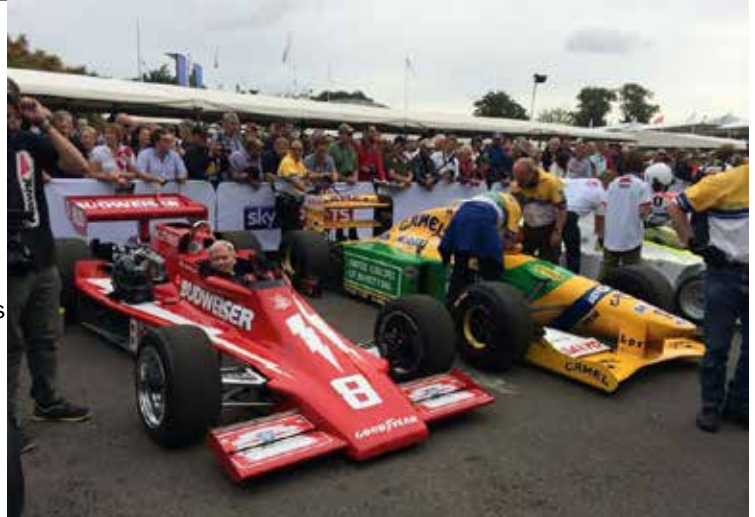
#8 Indy car alongside F1 Benneton car

On Saturday, the crowds are huge. The paddock is full of people walking through to see the cars and the track is lined with spectators. The drivers are getting a bit more rambunctious and five have wrecked in Holcomb's Corner. As the