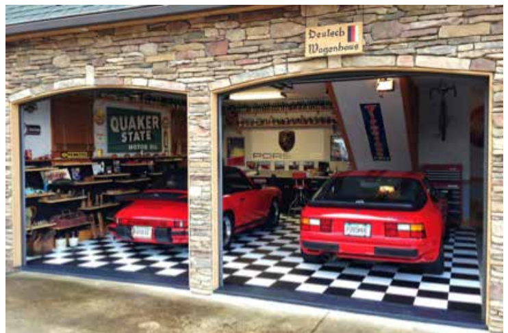
My 1986 944 Turbo and 1985 911 Cab in my newly finished garage.

So my current stable of 80's Porsches, a 1985 911 cab and a 1986 944T, reside in my newly completed garage that I have nicknamed the "Deutsch Wagenhaus". It is finished off with a "Race Deck" style black and white floor with antique signs and shelves to display my tool, technology and beer bottle collections. Both cars are driven regularly on some local back roads for exercise and my Porsche "fix." The 911 cab is more for open air, casual motoring; while the 944T is really at home carving canyons or attacking the mountains in upstate SC and western NC. (The 944T was set up for DE with aggressive camber, shocks and tires and is likely the equal of any modern car of similar power.)