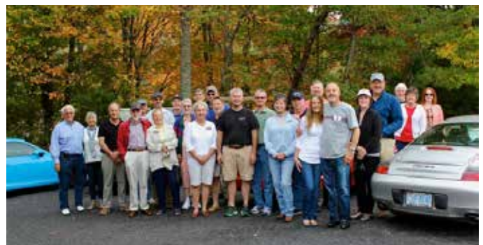
Group gathered for final Mountain Area drive and dine of the season.