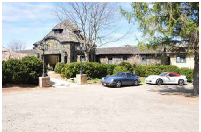
Three photos above: Chateau Morrisette caravan trip!