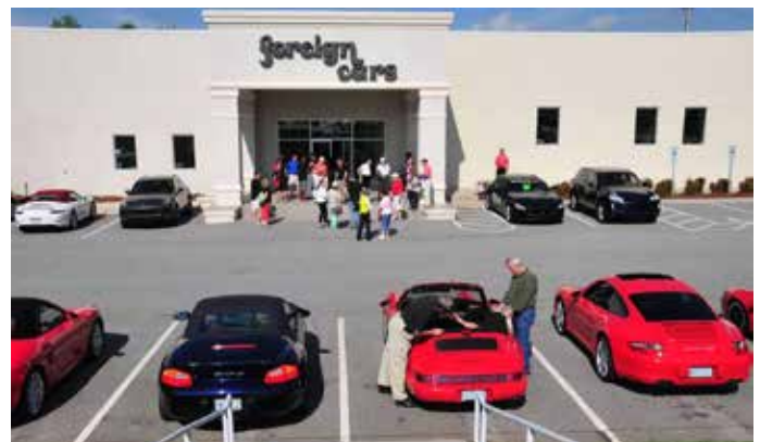
Loading up for Seagrove