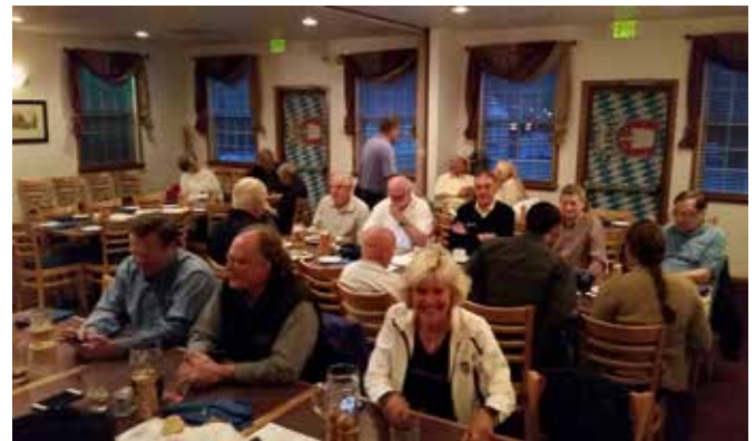
Metrolina monthly meeting at Waldhorn Restaurant

We hope to see you at our next monthly meeting for more good food and Porsche member friendship.