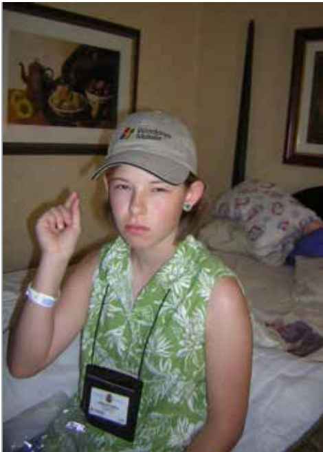
Top to Bottom: I can't wait to get going today, awards from the Parade Kids events, special guest Hans-Peter Porsche signing autographs