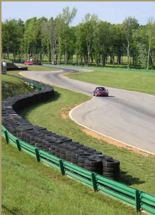
The author instructing at VIR

Are there not some ladies who have photos of their Porsches and interesting stories to tell involving them? I’d like to print those here. Please email me - howard@hwasserman.com