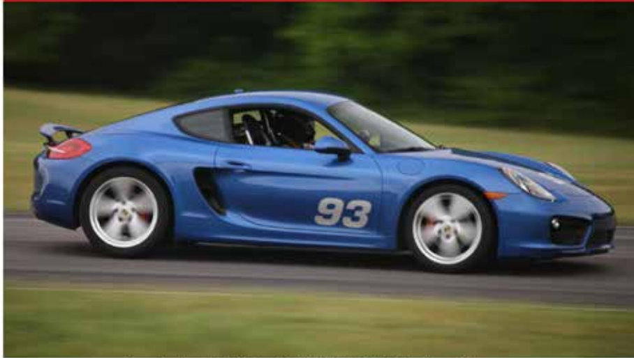
Accelerating into the front straight at Virginia International Raceway.

FROM THE STREET TO THE TRACK, WE'VE GOT YOU COVERED.