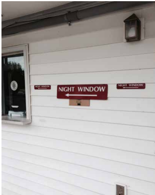
Tell me again, where's the night window?