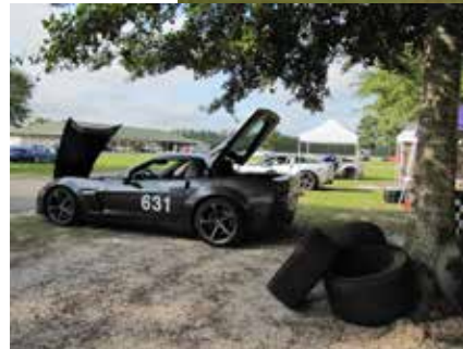
Clockwise from top: Drivers Meeting; Sat Social; Corvette Corner; Carmine at Sat Social