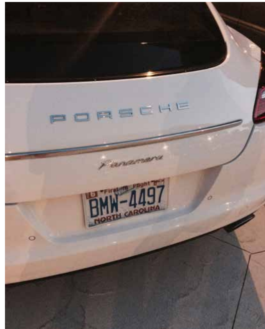
No it's not!