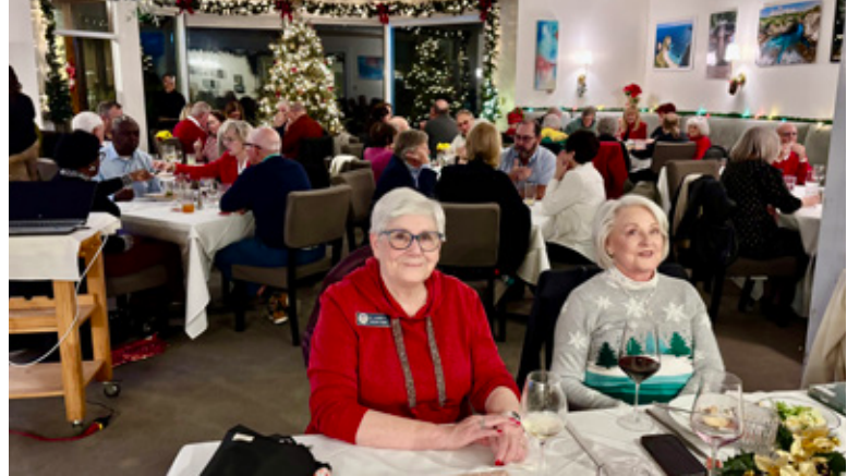
Sandhills record attendance

Sandhills Holiday and Member Appreciation party on December 2nd set an attendance record with sixty-eight members and guests.