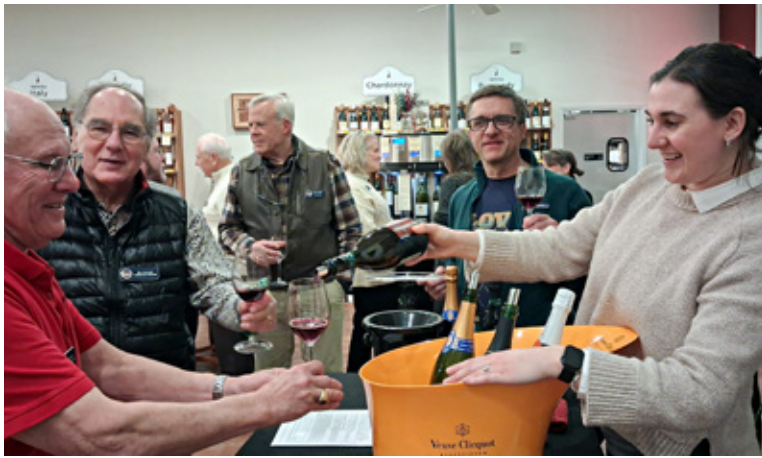
Pouring the red Italian sparkler