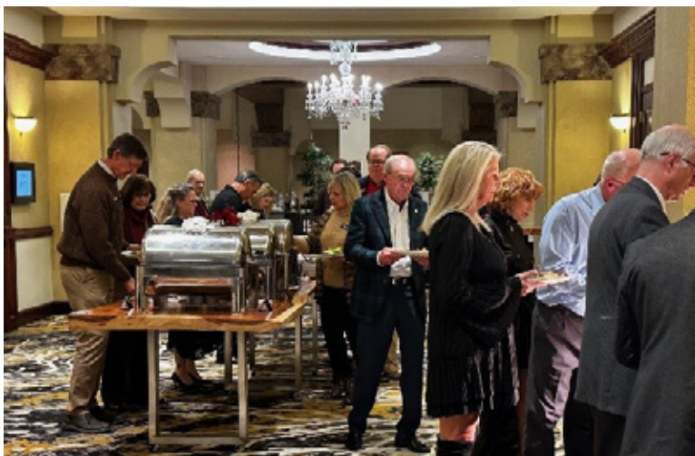
Buffet at Grandover Resort