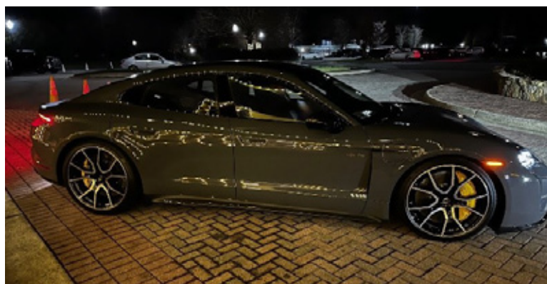
2025 Electric Porsche Taycan