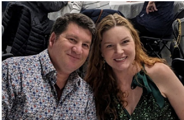
So much Holiday cheer!!