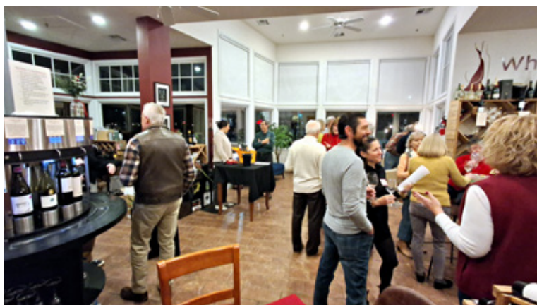
Mingling with the group