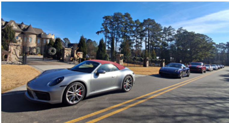
Stop at the "Castle" on Olive Chapel Rd.