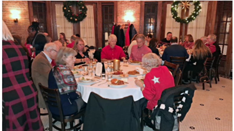
Enjoying the dinner