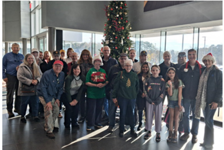
Triangle members and Porsche Southpoint Staff