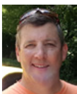
By Jeff Price