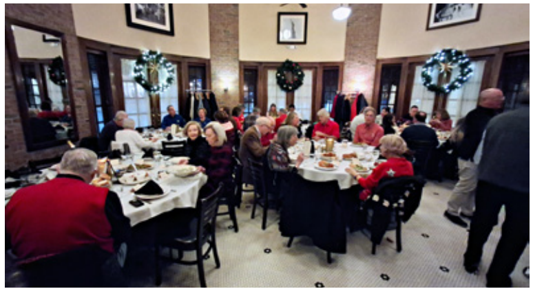
Maggiano's festive private dining room