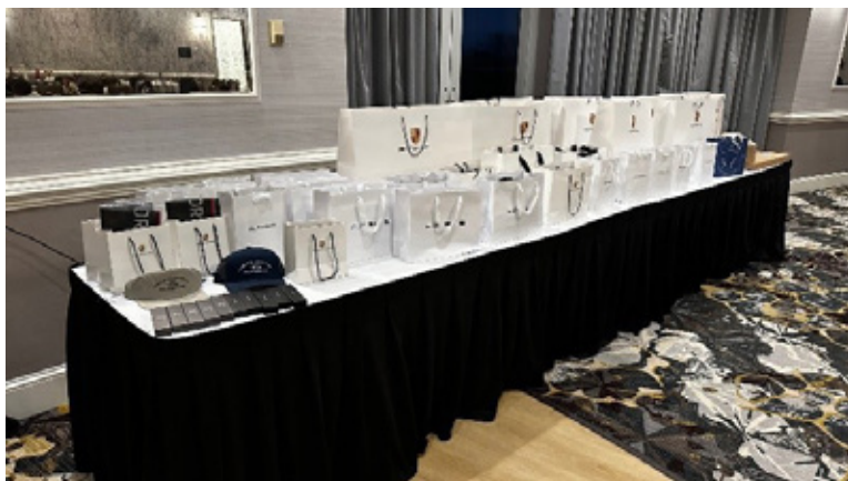
Holiday Party Giveaways

We ended the night with a surprise giveaway of a bag of coveted Cinnamon Sweet Buc-ees Beaver nuggets that were smuggled in from Florence, South Carolina earlier that day.