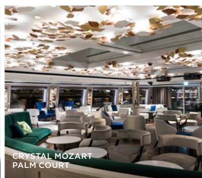
CRYSTAL MOZART PALM COURT