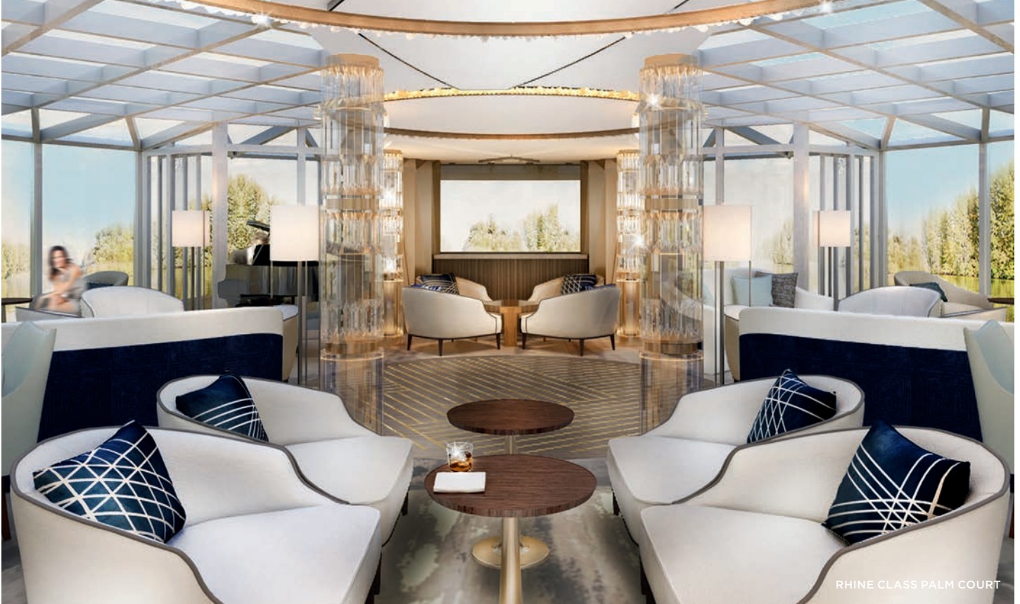
RHINE CLASS PALM COURT