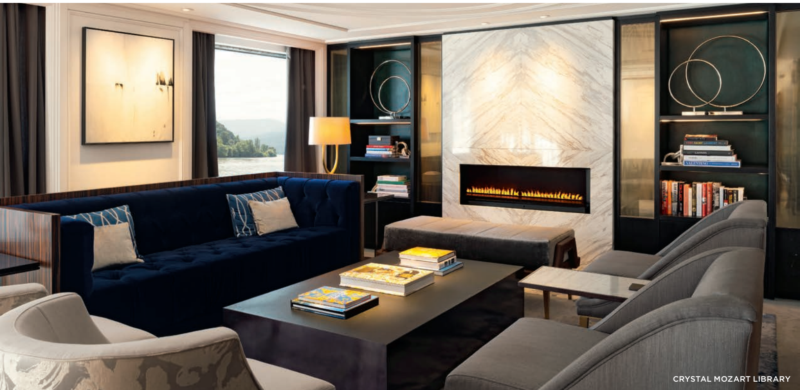
CRYSTAL MOZART LIBRARY