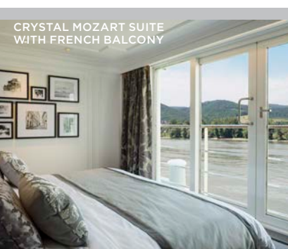
CRYSTAL MOZART SUITE WITH FRENCH BALCONY

Once your clients complete their first Crystal experience and become a Crystal Society® member they are eligible to qualify for an additional $500 per guest , up to $1,000 per suite, off on their second Crystal voyage when booked within 180 days of disembarkation.