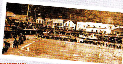
BOATER UP! Boats yielded to bats on the baseball diamond. The creek mouth was later dredged for Thomas Basin.