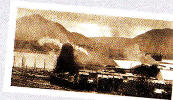
WE SAW HISTORY Ketchikan Spruce Mill operated in the heart of downtown for 80 years, closing in the mid-1980s.

37 Casey Moran Harbor / City Float. Used by commercial fishers, visitors and the local recreational fleet. In the early 1900s, the home for what was believed to be the world's largest fleet of halibut boats.