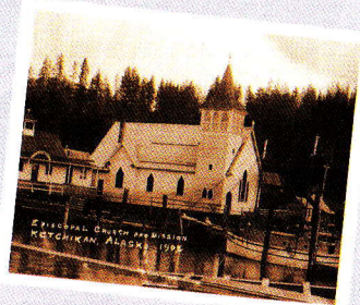
STEEPLE AT THE SHORE St. John's Episcopal Church, new in 1902, rested on pilings at the water's edge.

4 St. John's Episcopal Church and Yates Building. Built in 1902, St. John's is the oldest church building standing in Ketchikan. The sanctuary, finished with cedar from a Saxman mill, stood on pilings along the water; fill moved the shore hundreds of feet back. St. John's has a gift shop. The Yates Building was built as a hospital in 1904 and later housed Alaska Sportsman magazine. 2 minutes to next site.