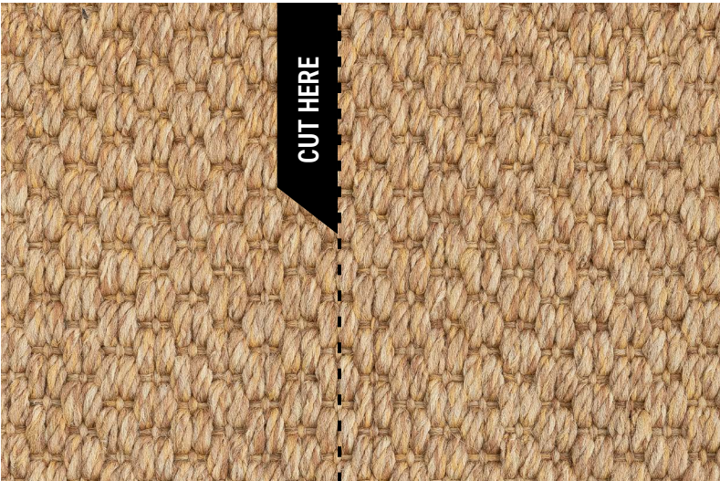
Figure 1: Cut 3rd row in from the center seam.

⚠ When cutting seams, be mindful of the quality of material you are working with. Always use sharp blades. Do not use hook blades , as they will cause excessive and unnecessary fraying