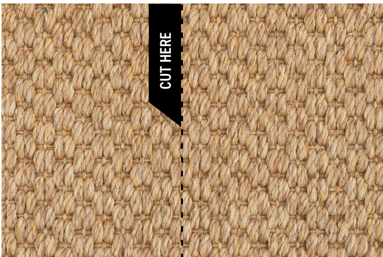
Figure 1: Cut 3rd row in from the center seam.

⚠ When cutting seams, be mindful of the quality of material you are working with. Always use sharp blades. Do not use hook blades, as they will cause excessive and unnecessary fraying