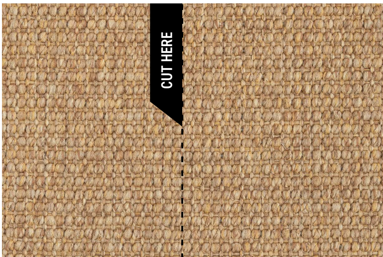
Figure 1: Cut 3rd row in from the center seam.

⚠ When cutting seams, be mindful of the quality of material you are working with. Always use sharp blades. Do not use hook blades , as they will cause excessive and unnecessary fraying