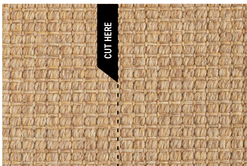
Figure 1: Cut 3rd row in from the center seam.

⚠ When cutting seams, be mindful of the quality of material you are working with. Always use sharp blades. Do not use hook blades, as they will cause excessive and unnecessary fraying