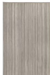
LE32221 Warm Sand