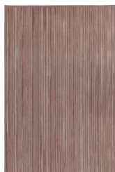
LE24220 Indian Summer