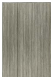
LE15222 Mystic Green