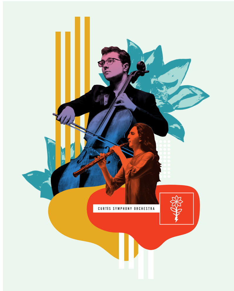
CURTIS SYMPHONY ORCHESTRA