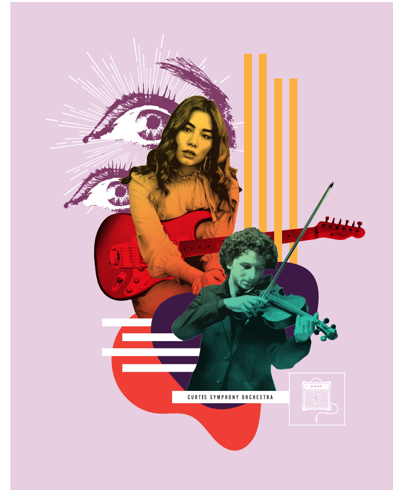
CURTIS SYMPHONY ORCHESTRA