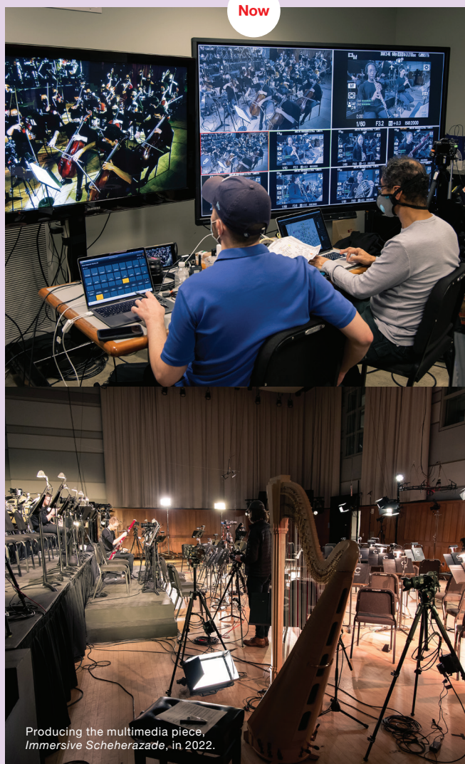
Producing the multimedia piece, Immersive Scheherazade , in 2022.

Television and online media have brought Curtis to new, wider audiences. Since 2005, PBS affiliate WHYY-TV has presented On Stage at Curtis , which airs Fridays at 8:30 p.m. and features concerts recorded in Field Concert Hall. Curtis' YouTube channel, with nearly 27,000 subscribers, presents notable performances from the current and previous seasons.