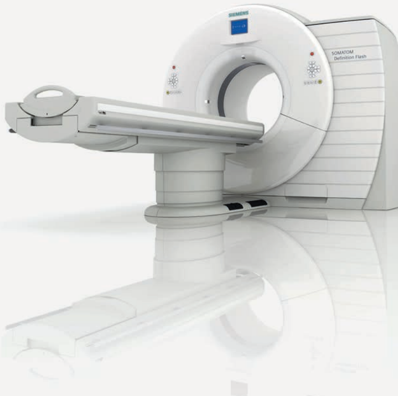
Gifts to “Our Legacy” campaign will fund the purchase of a $1 million 128-Slice CT Scanner for HYMC. Below: Detailed heart image captured by the scanner.