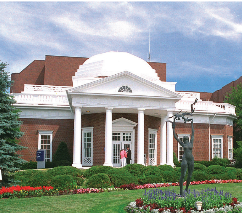
Howard Young Medical Center, Woodruff, WI