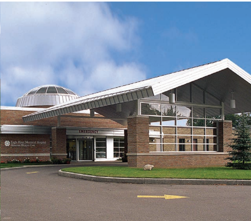
Ministry Eagle River Memorial Hospital, Eagle River, WI