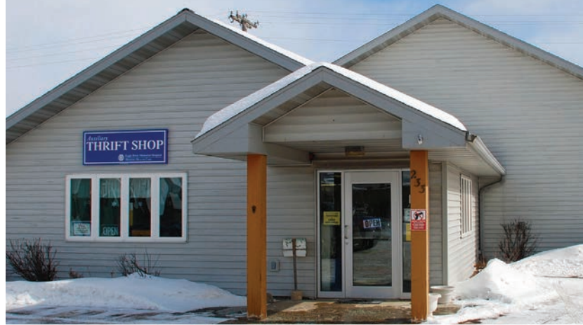
Auxiliary Thrift Shop, Downtown Eagle River, is a successful and continual fundraiser.