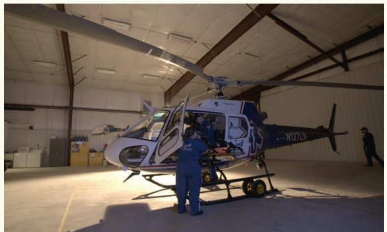
Scenes from the Howard Young Foundation Video, “Legacies.”