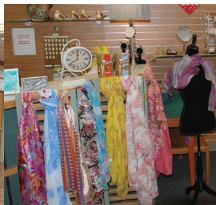
Howard Young Medical Center Auxiliary Gift Shop (far left), Ministry Eagle River Memorial Hospital Auxiliary Gift Shop