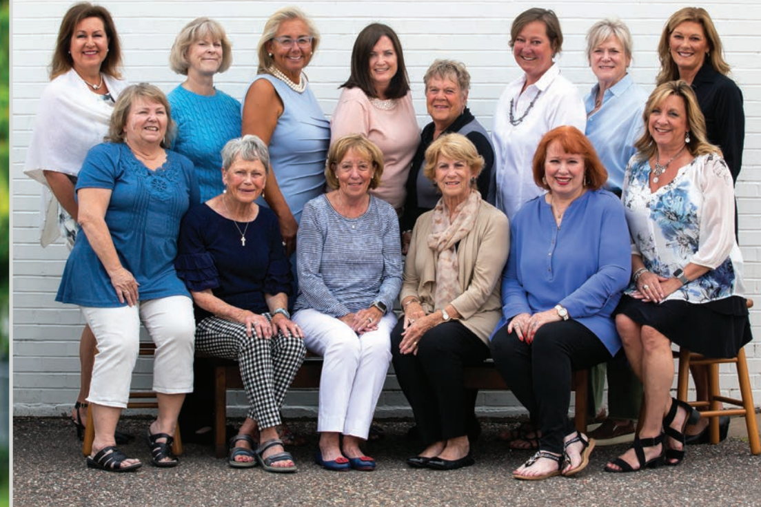
Women's Legacy Council members, 2021

Celebrate the holiday season while benefiting Lakeland Pantry. Wine tasting, holiday demos, festive holiday appetizers and gift raffles. You won't want to miss it!