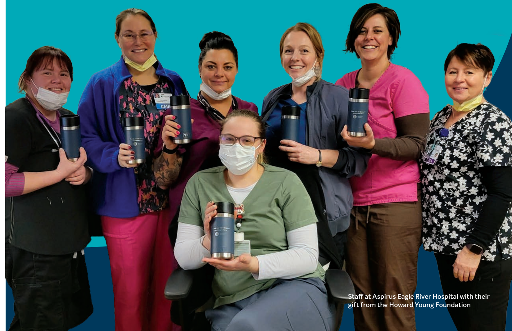
Staff at Aspirus Eagle River Hospital with their gift from the Howard Young Foundation

We see and hear the difference they make every day through feedback from patients. The Howard Young Foundation is forever grateful for our hospitals and the staff who provide services for our families, friends and neighbors who call the Northwoods home.