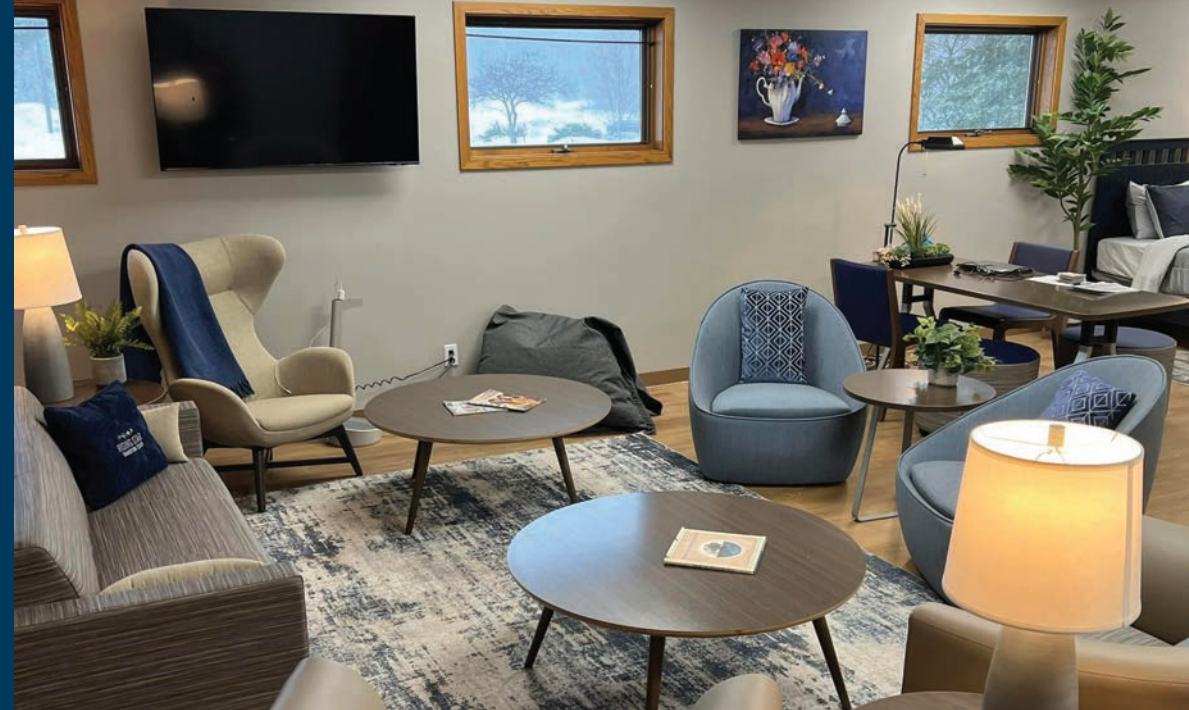
Rising STAR Transition Center completes its first year. Read about the students' success on page 12