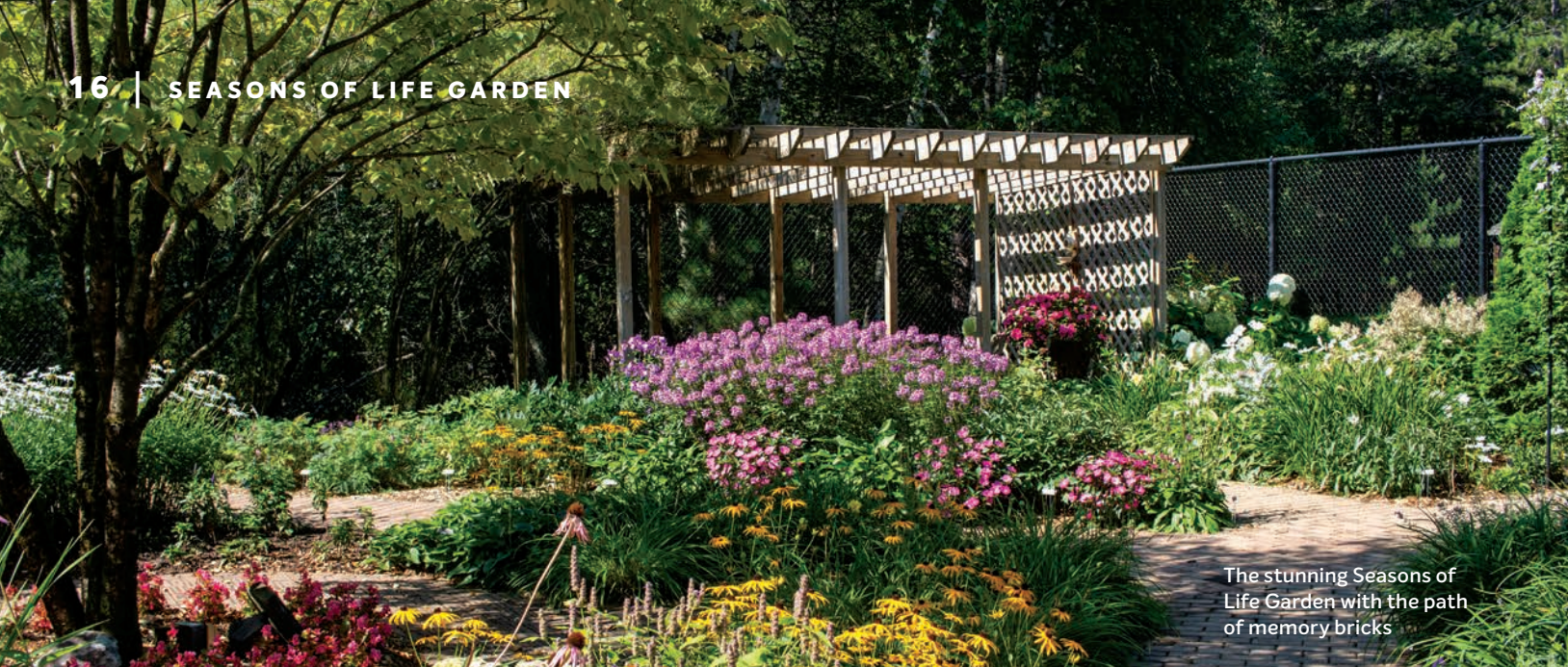
The stunning Seasons of Life Garden with the path of memory bricks