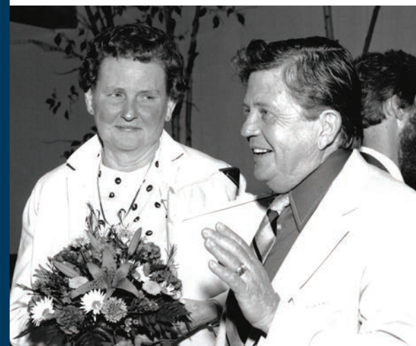
Read about the Koller family legacy on page 14