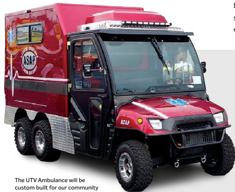
The UTV Ambulance will be custom built for our community needs using this and similar vehicles as inspiration.