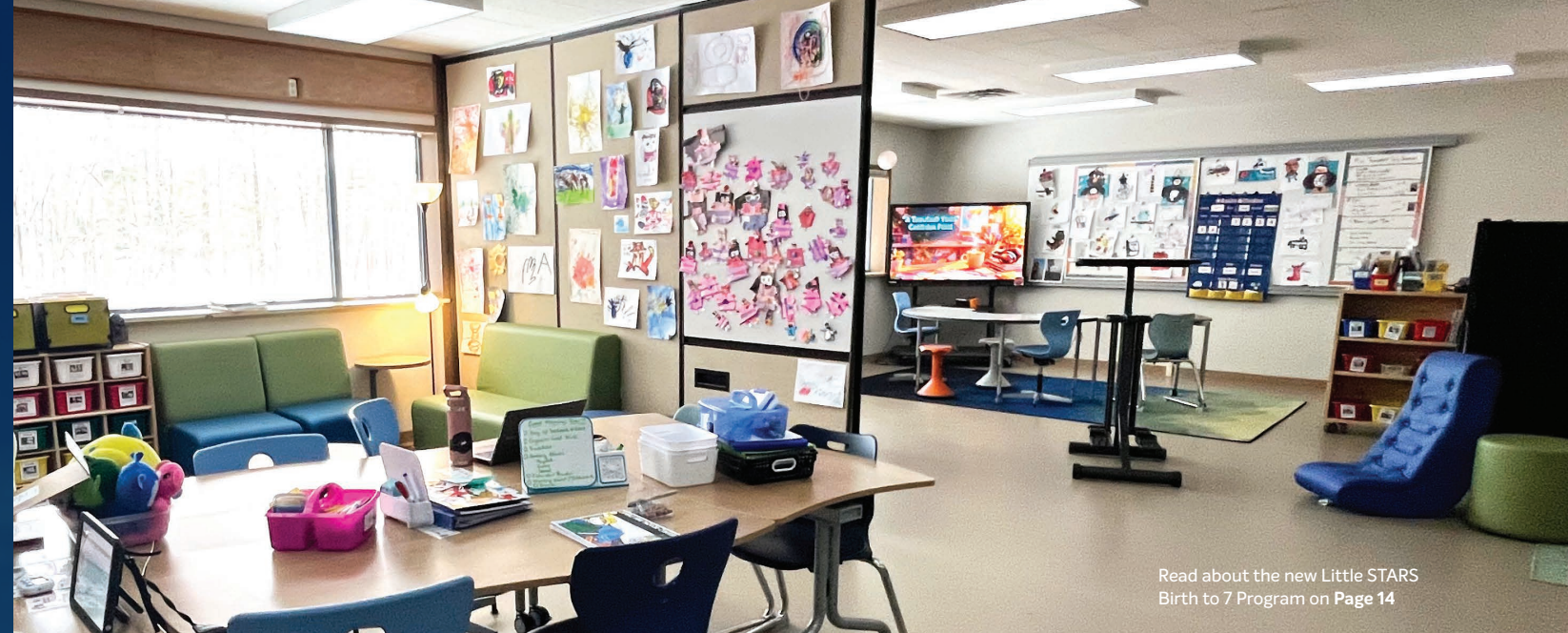
Read about the new Little STARS Birth to 7 Program on Page 14