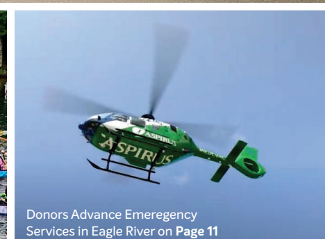
Donors Advance Emergency Services in Eagle River on Page 11