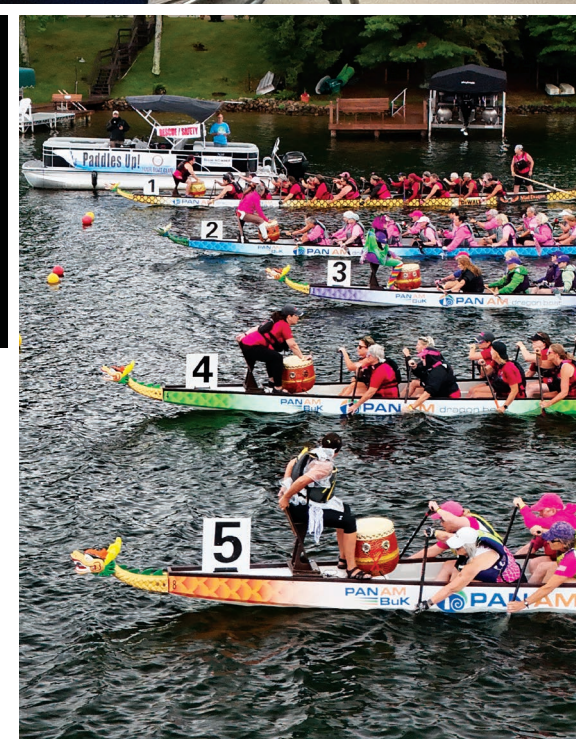
Feel the energy of the 10th Annual Minocqua Dragon Boat Festival on Page 8