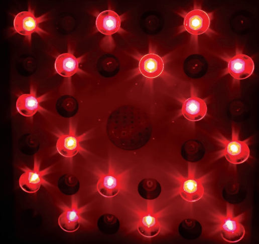
The Tick-Borne Illness Center will introduce red light therapy to support patients' healing in a new way.

Give the gift of healing to the Tick-Borne Illness Center at howardyoungfoundation.org .