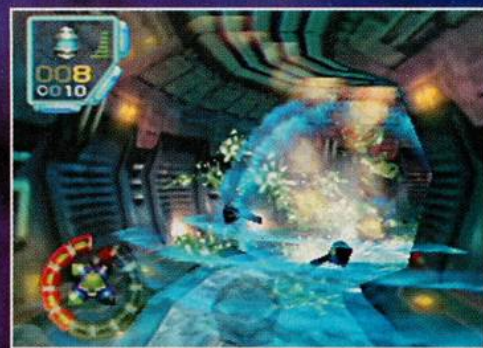
Effects-filled explosions make battles visual treats.

FROM THE CREATORS of GoldenEye 007 and Diddy Kong Racing comes Jet Force Gemini, another epic N64 adventure that should have gamers lining up at cash registers. Jet Force's captivating blend of action-packed third-person combat, Zelda-esque adventuring, and gorgeous graphics make it one of the top games this fall.