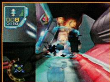
PROTIP: Drones crouching behind shields! Lob grenades.

Jet Force is an absolutely huge, nonlinear game, and it's that "working individually" part that makes it so big. At the beginning, the three split up, and you start out as Juno. As the game progresses, you'll rescue