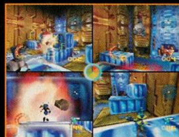
PROTIP: The best approach to death-matches in the SS Anubis arena is to park yourself on high ground and snipe at opponents as they run past below.

Vela, team back up with Lupus, and even locate Floyd the flying droid. Naturally, each character has different abilities: Vela (like all female game characters) can jump pretty high, Lupus (like, um, few dogs) can fly, and so on. Because you can replay any level at any time, going back and exploring levels with different characters unlocks tons of new areas, secrets, and the like. Jetpacks let you fly to hidden high spots, the crowbar pries open trap doors, and even Floyd can unlock new rooms.