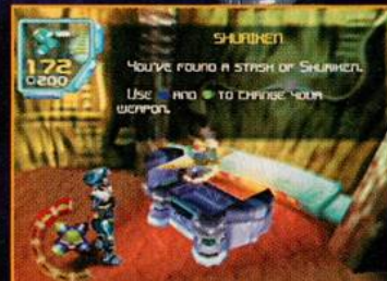
PROTIP: Collect the gold key from the tunnels behind the life-force door in the Outset Goldwood area. Return to the beginning of the level. Open the gold door to score some shurikens.