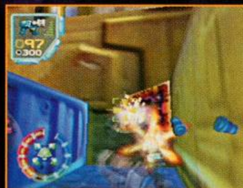
PROTIP: If you're facing the conveyor belt in the SS Anubis hold, locate the proximity mines on the left and shoot the cell-door plate to unlock Vela's cell.