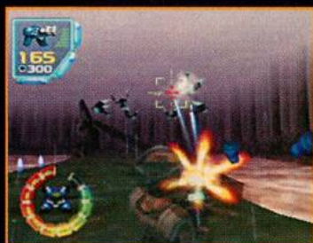
PROTIP: The machine gun's pretty inaccurate, but its spread pattern makes it useful for mowing down crowds.