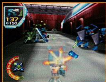
PROTIP: When facing more than one enemy, keep moving (strafing's a good idea) and take cover when possible.