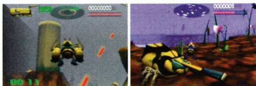
The enemies are well-drawn and can be absolutely huge

Buck Bumble is a very good game that successfully takes some of the tried and tested formulas of many early 90s shoot-'em-ups and combines them with the graphical technology we have today. There isn't too much that is ground-breaking or fantastically original about it, but that shouldn't stop you from enjoying this highly entertaining, if slightly difficult shooter. Will