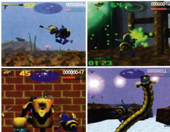
Take control of the coolest bee on the planet. It's a shame that you spend most of the game looking at his butt

The enemies in Buck Bumble are variations on your typical insects. Dragonflies pose little threat, neither do many of the ground-based beetles, but a swam of wasps can prove troublesome because of their speed, often forcing you to dive low and take them out in the grasses where your manoeuvrability gives you the upper hand.