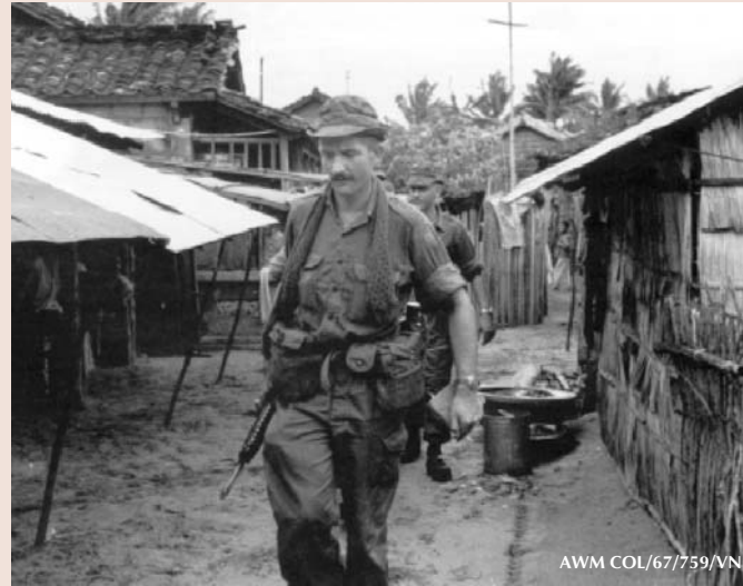
On patrol through a village