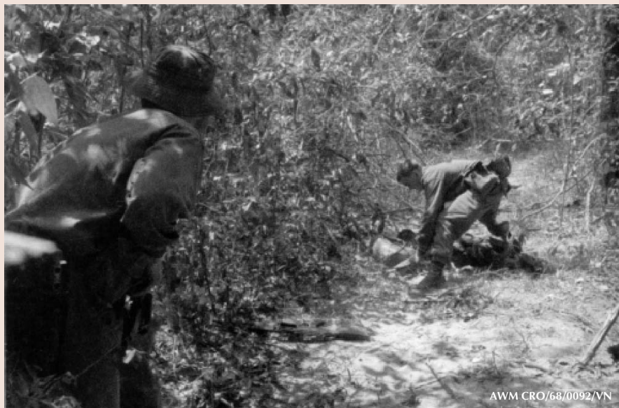
A wounded man on a patrol