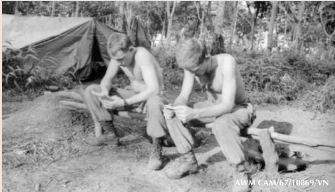
At rest in camp at Nui Dat