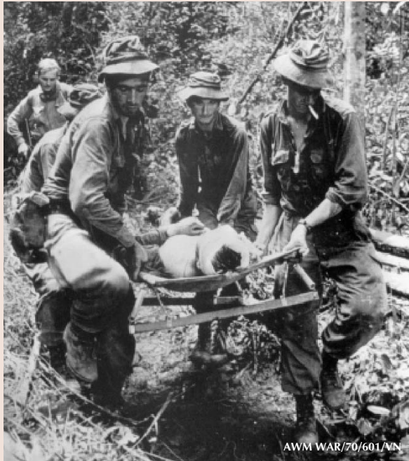
Carrying a wounded man to an evacuation helicopter