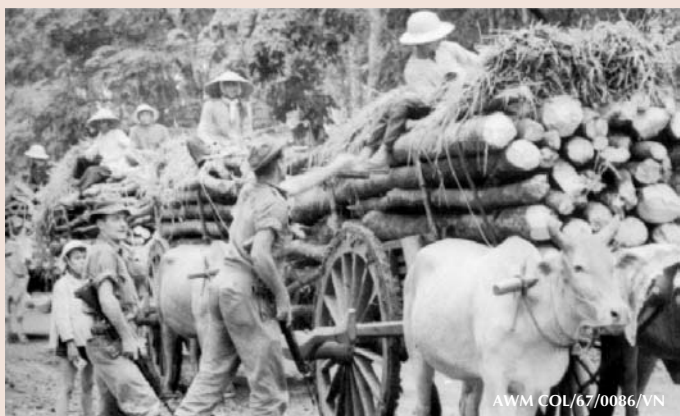
Searching an ox cart