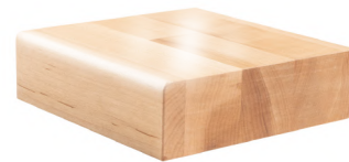
Varnique Semi-Gloss Finish