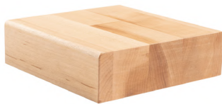
Urethane-Based Satin Finish