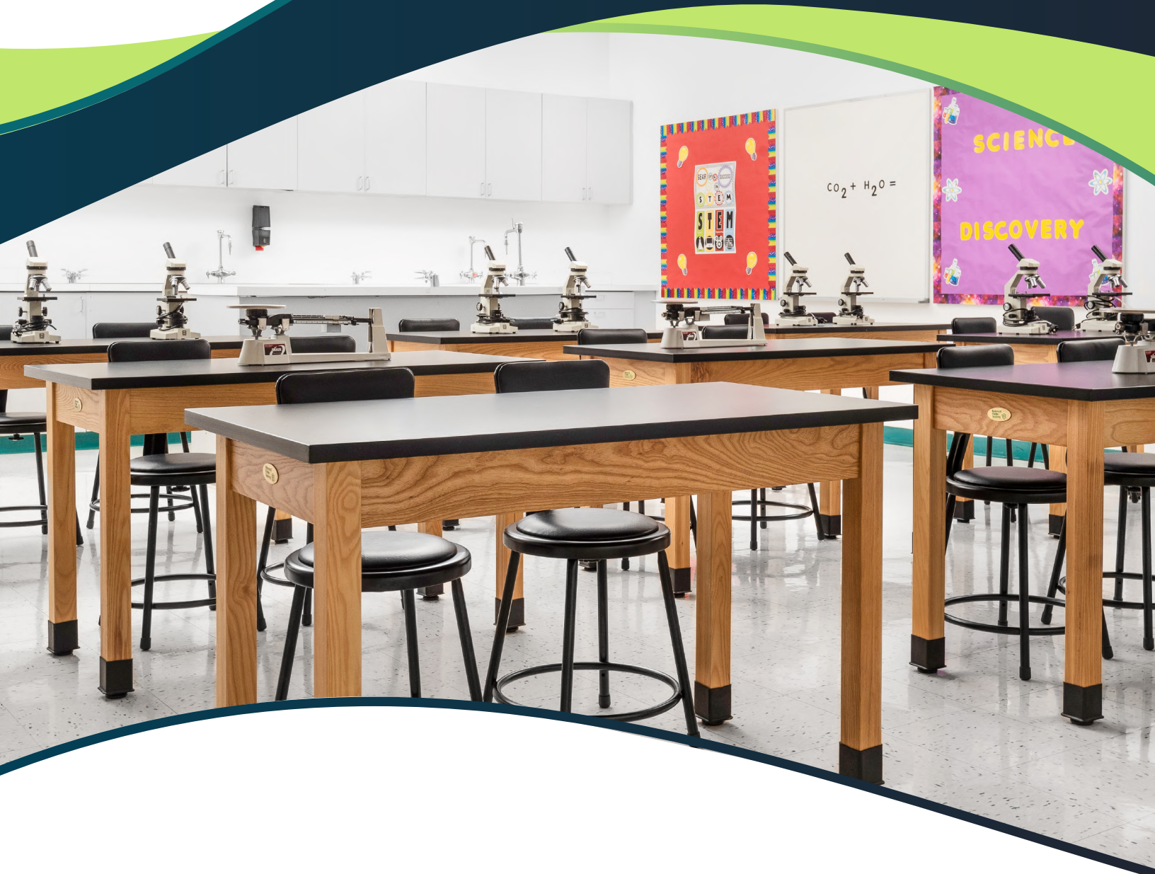
Wood Tables Series

Full line of science tables made for the most rugged environments.