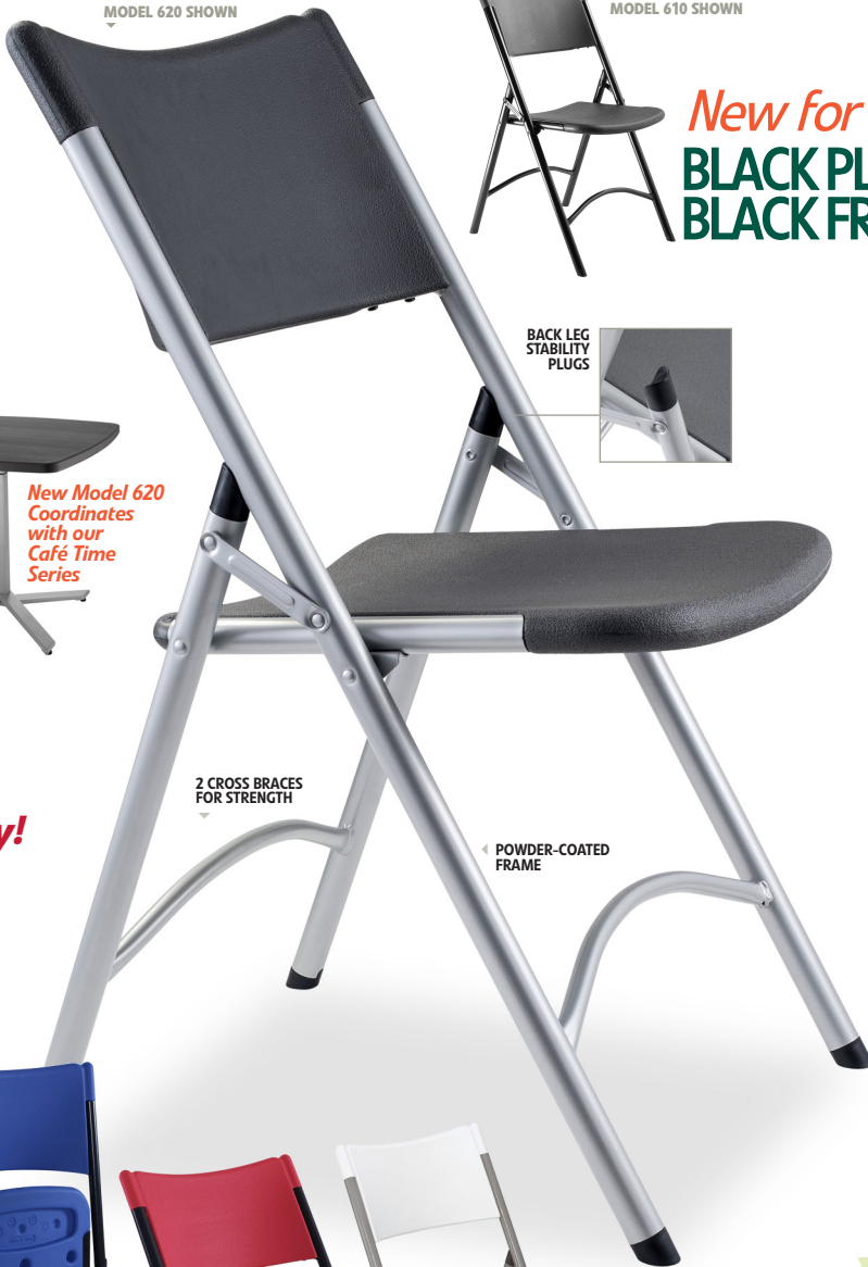
MODEL 610 SHOWN