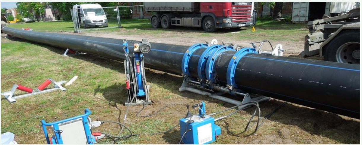
Figure 1. HDPE pressure pipes installation process stage