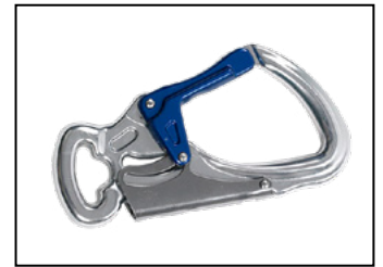
IKV 11 (EN 362:2004-T)