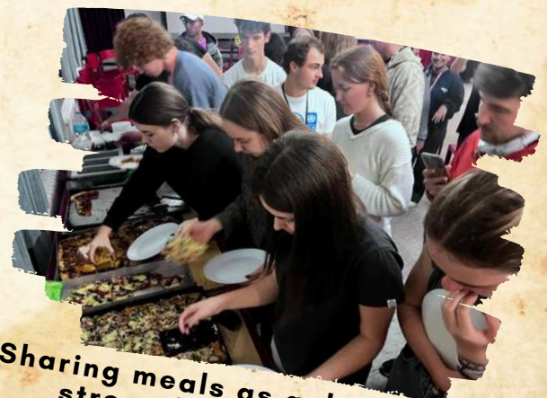
Sharing meals as a daily ritual strengthens connection

These shared rituals help transform the group into a supportive, connected community.