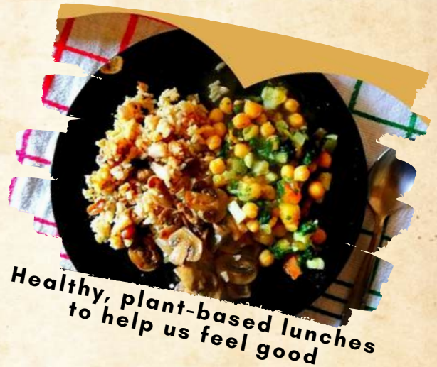
Healthy, plant-based lunches to help us feel good

All lunch meals will be vegetarian or vegan to lower our ecological footprint and promote mindful, sustainable eating.