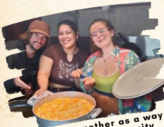
Cooking together as a way of building community