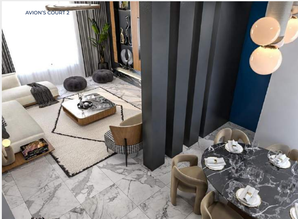
AVION'S COURT 2