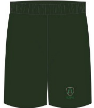
Green shorts (boys only)