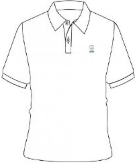
White polo shirt