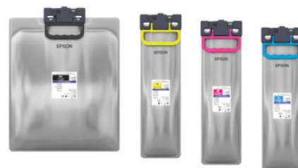
Available in standard or high capacity ink packs.

With easy and simple to use features, our innovative Replaceable Ink Pack System (RIPS) lets you enjoy printing of up to 86,000 pages in black and 50,000 pages in colour. With easy installation and low intervention, you will minimise the frequency of replacing your consumables, experiencing less downtime.