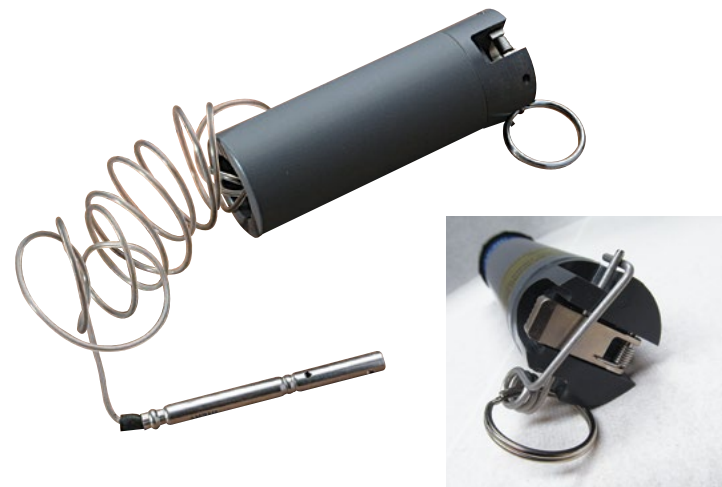
* Trainer available upon request

3.8 Delay IFD - EX-2007030153 Instant IFD - EX-2012050582 Single: Detonator, Assemblies, Non-Electric UN0500, 1.4S