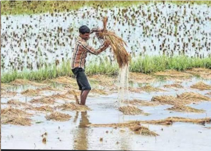
Climate induced flood