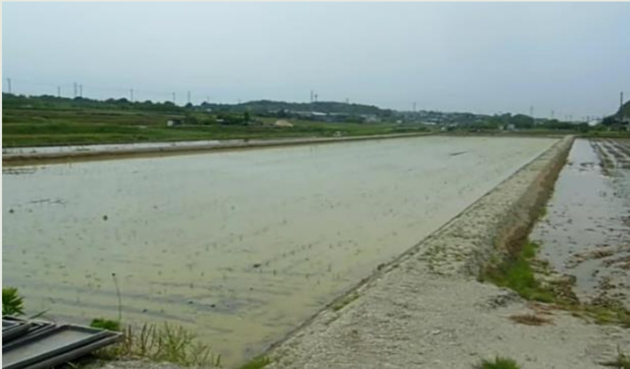
Water efficient paddy rice fields.

My company solution to this problem is leveraging on locally available technological tools to build water efficient paddy rice fields for my rice production. This field are common in agriculturally developed countries but rare if not unavailable in Nigeria.