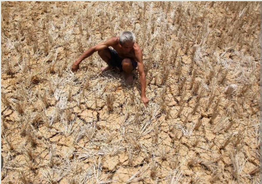
Climate induced drought

The United Nations Food and Agricultural Organization (UNFAO) reported that 25.3 million people in Nigeria would face acute food insecurity during the June to August 2023 lean season. Climate change induced drought and flood are one of the major contributors to Nigeria food insecurity.